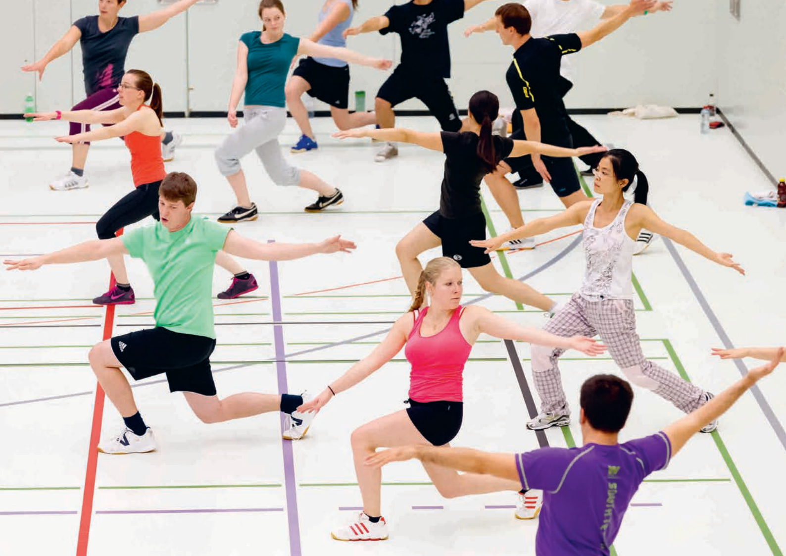
The academic sports association ASVZ offers facilities for over 70 forms of sports and wellness.