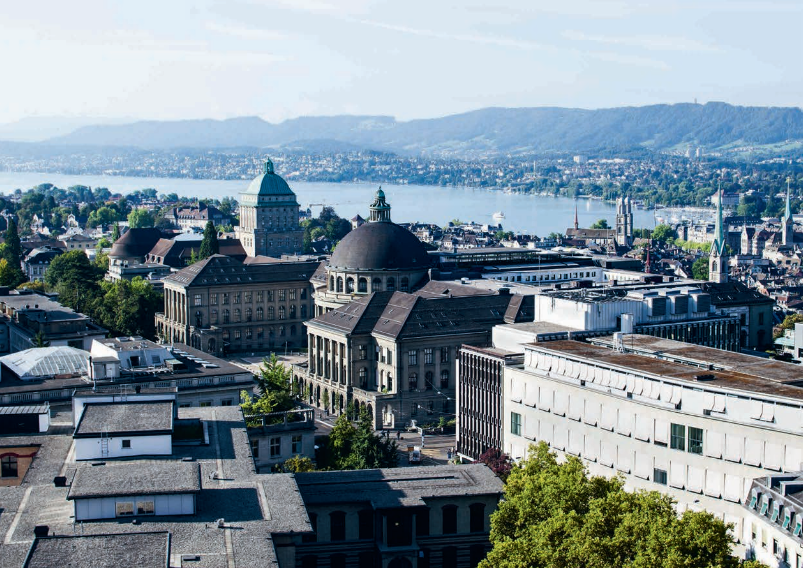
The historic main building is right in the centre of vibrant Zurich. ETH Zurich shares many facilities with next-door neighbour University of Zurich.